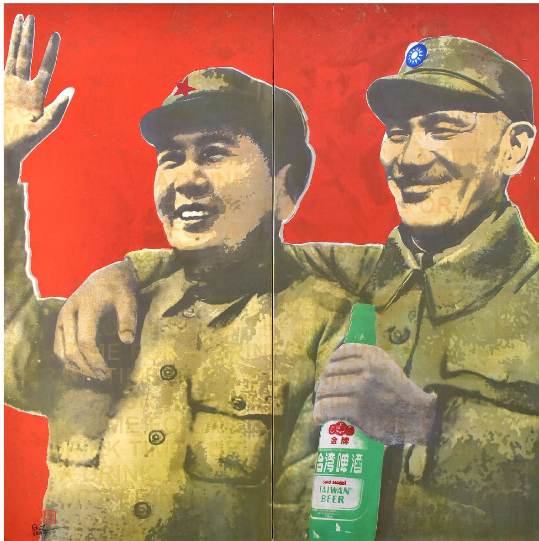
Time For A Drink 242 x 242 cm, silkscreen print, 2023

160 x 160 cm, mixed media on canvas, 2019