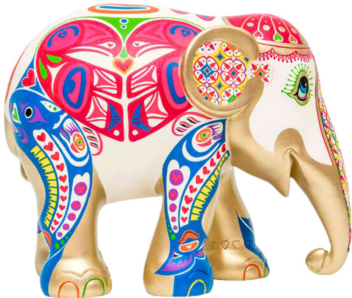
Love Wild, Love Free 30 cm | Polyresin & Acrylic | 2018