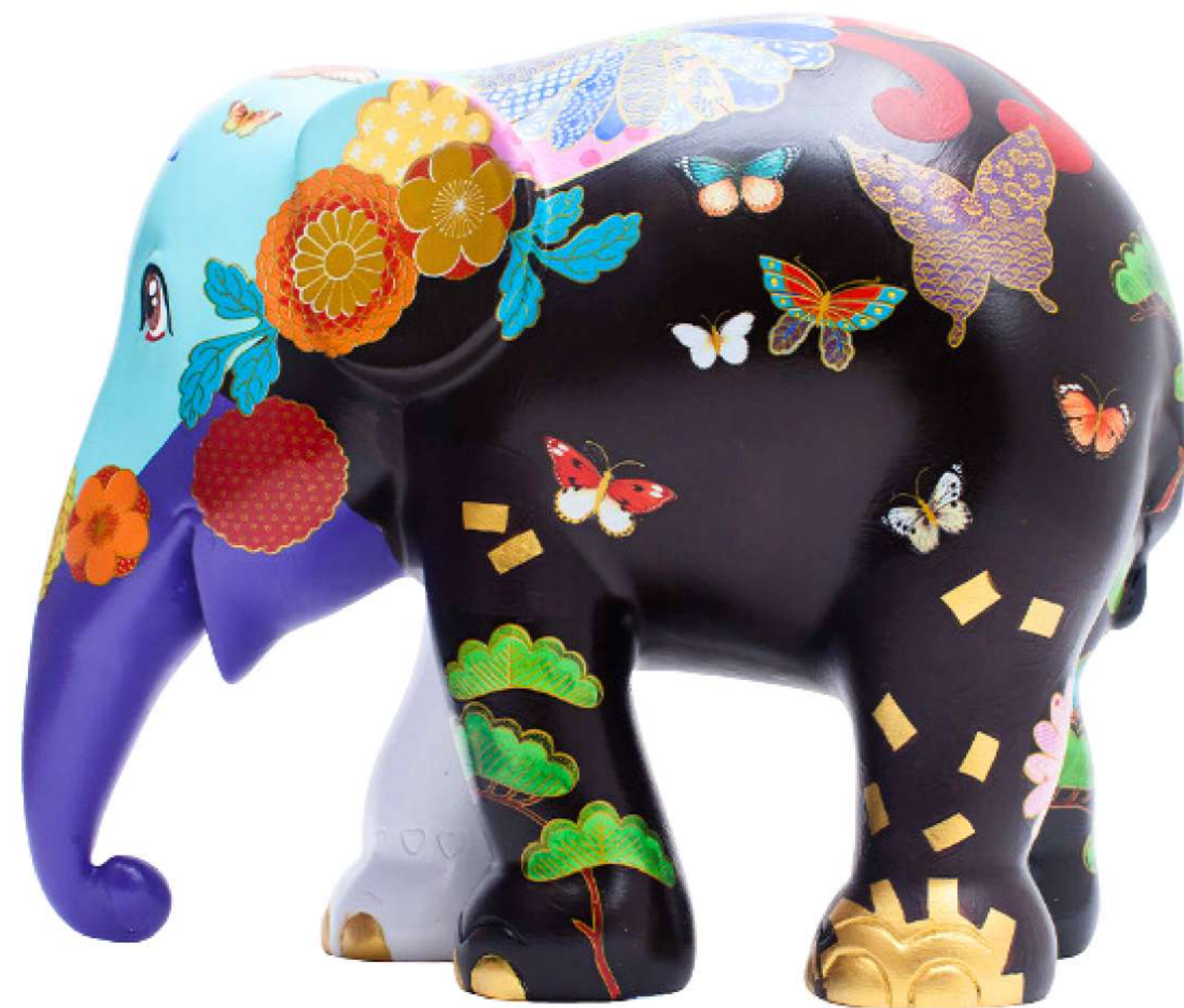
Kiku 30 cm | Polyresin & Acrylic | 2013