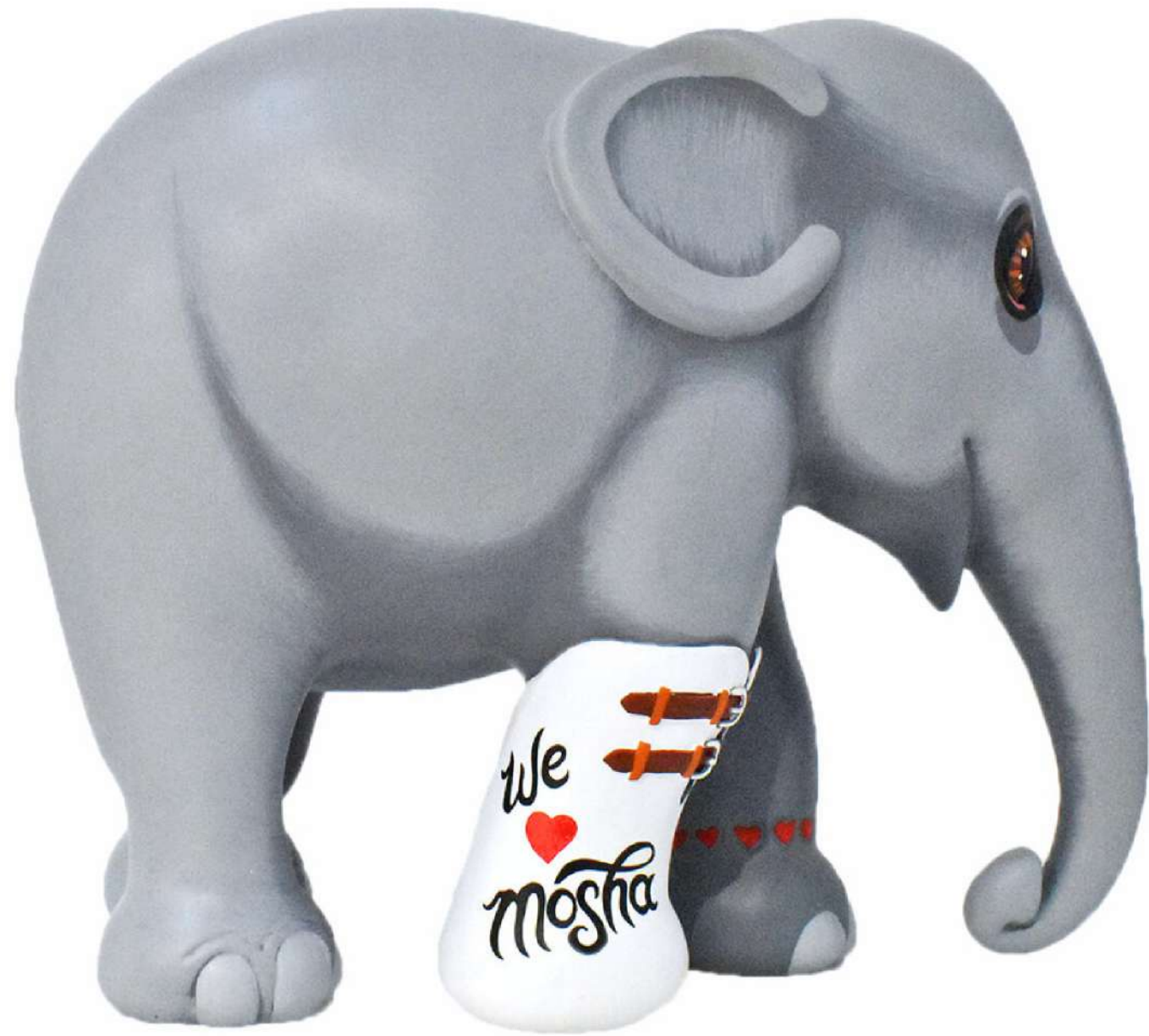
We Love Masha ( Global ) 30 cm | Polyresin & Acrylic | 2014