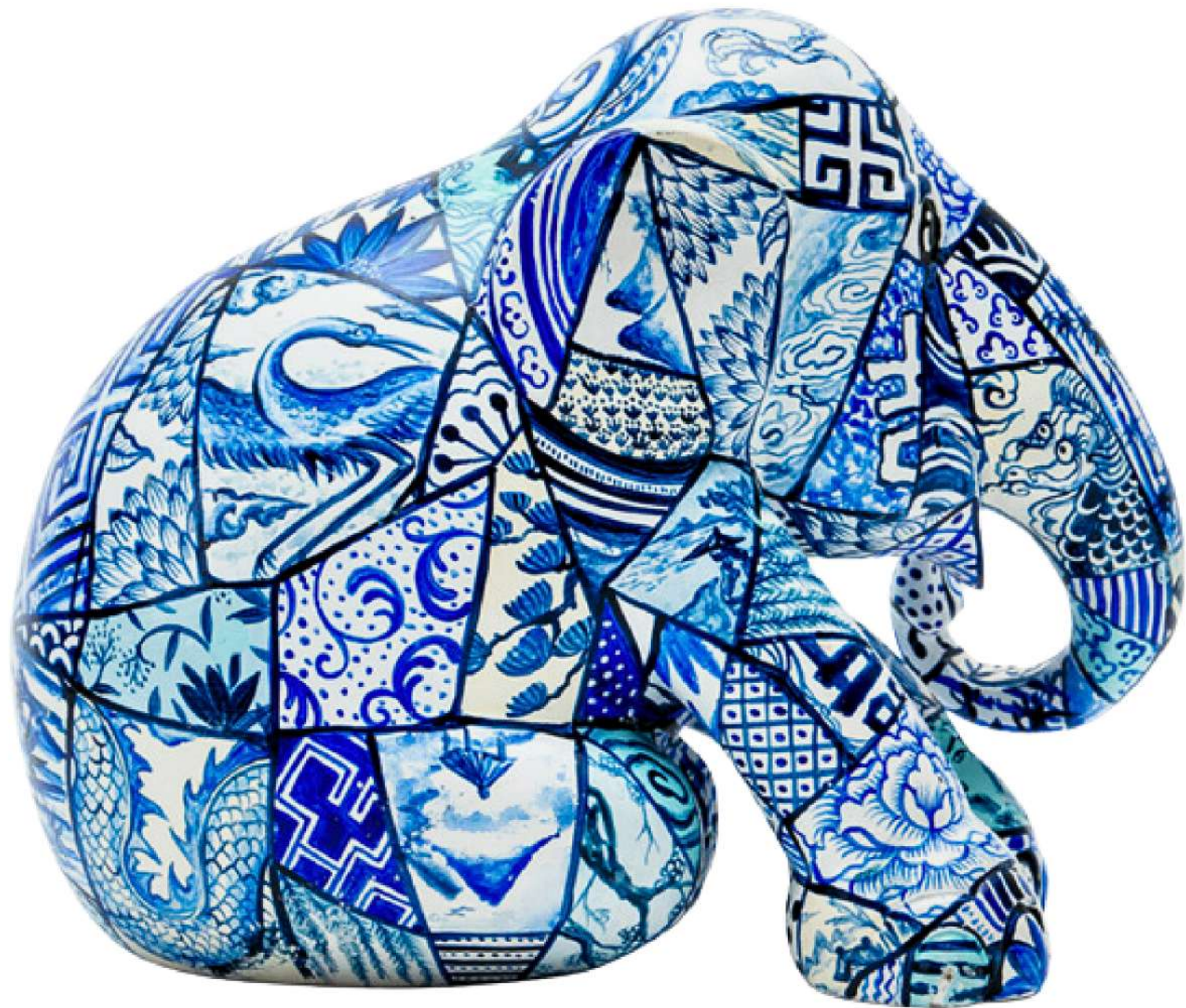
Porcelain Patchwork 30 cm | Polyresin & Acrylic | 2018