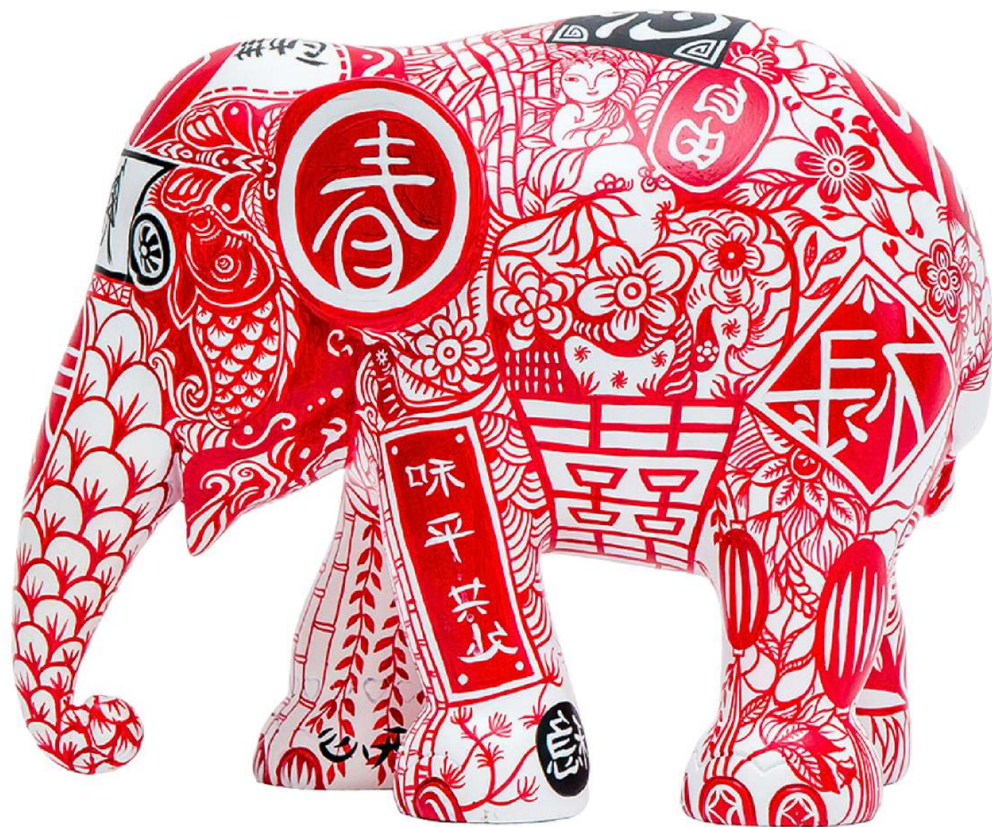
Little Happy ( Xiao Le )