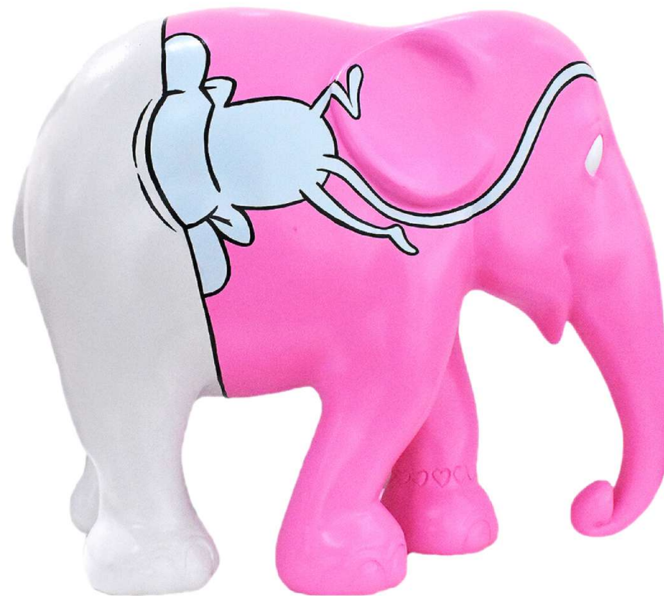
Peeping Blue One