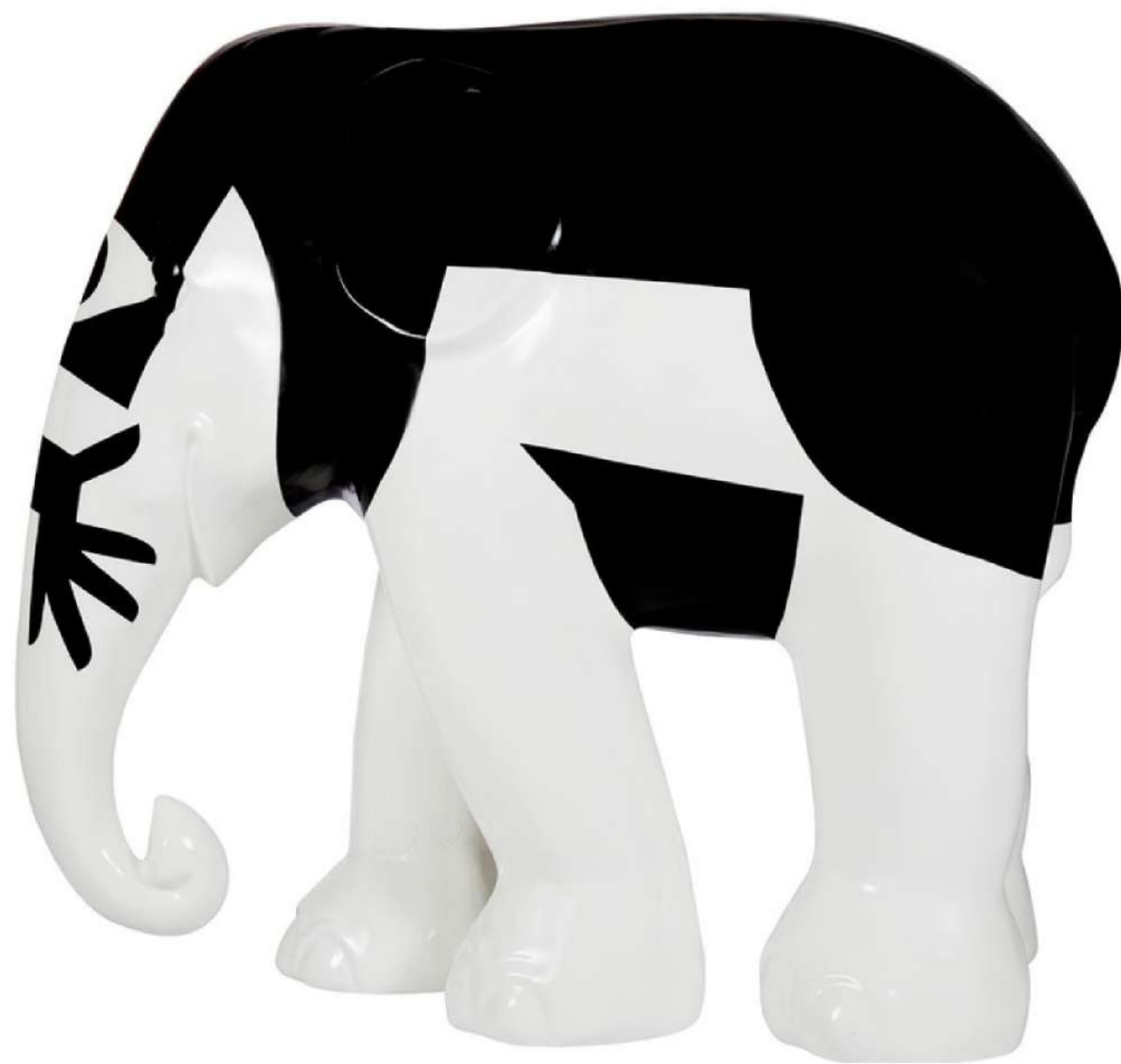
The Elephant's Eye 20 cm | Polyresin & Acrylic | 2016