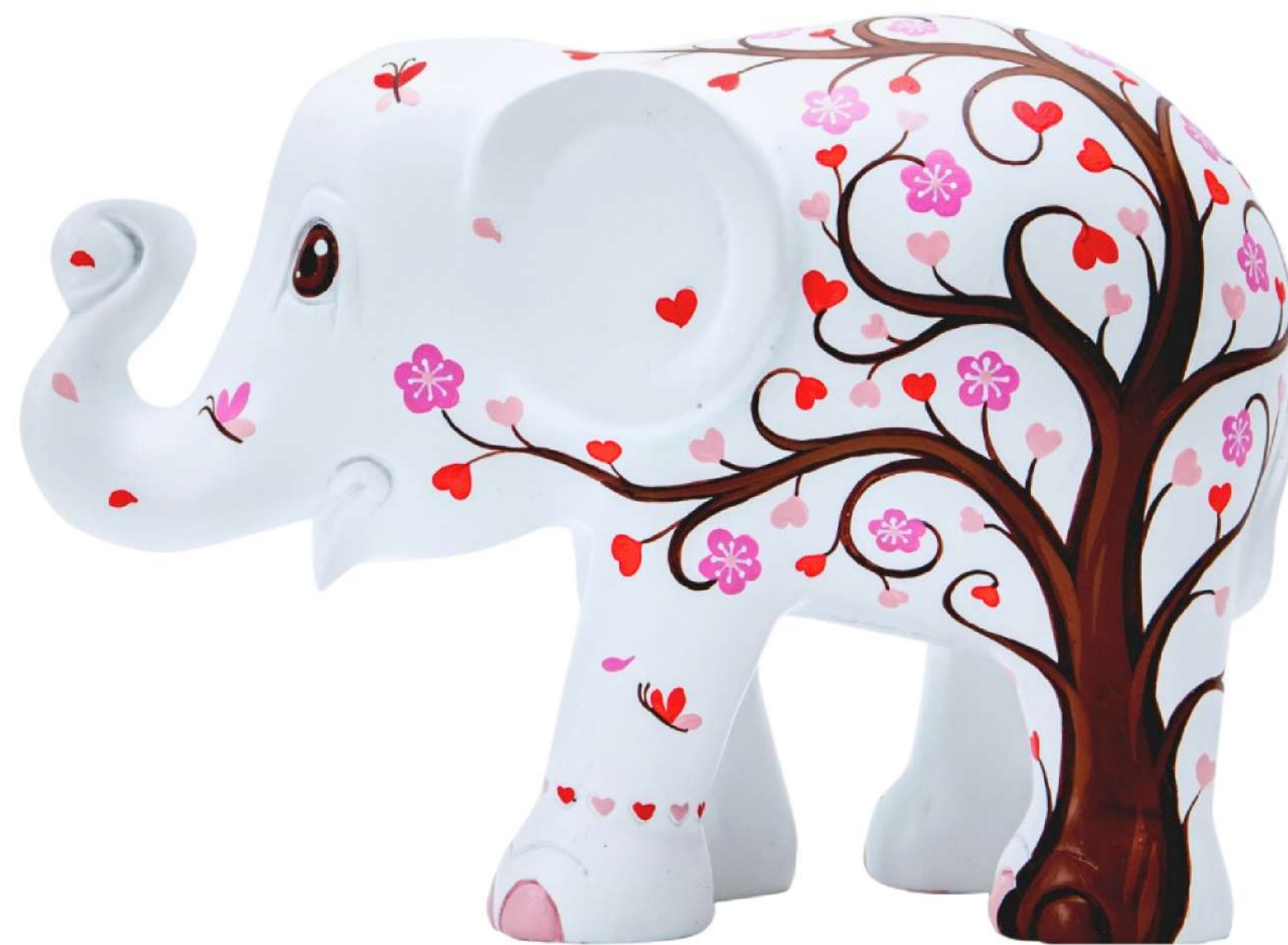
Blossoming Tree of Life 30 cm | Polyresin & Acrylic | 2018