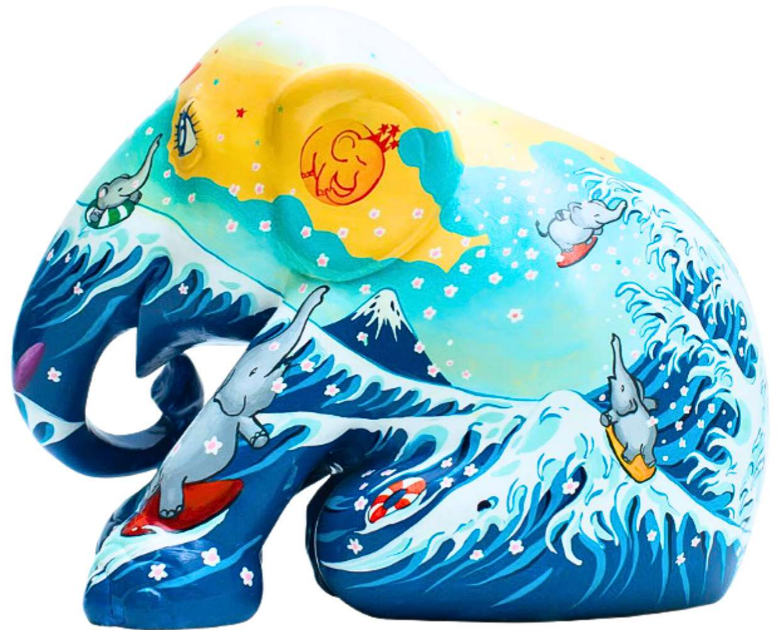
Morning Tide 30 cm | Polyresin & Acrylic | 2015