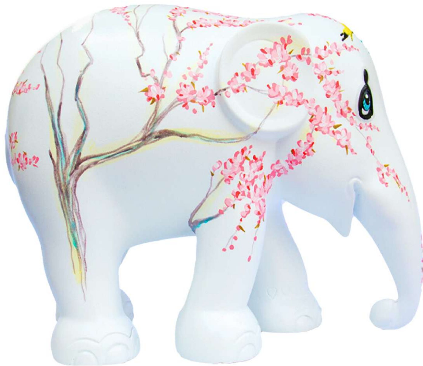
One Hundred Flowers 30 cm | Polyresin & Acrylic | 2013