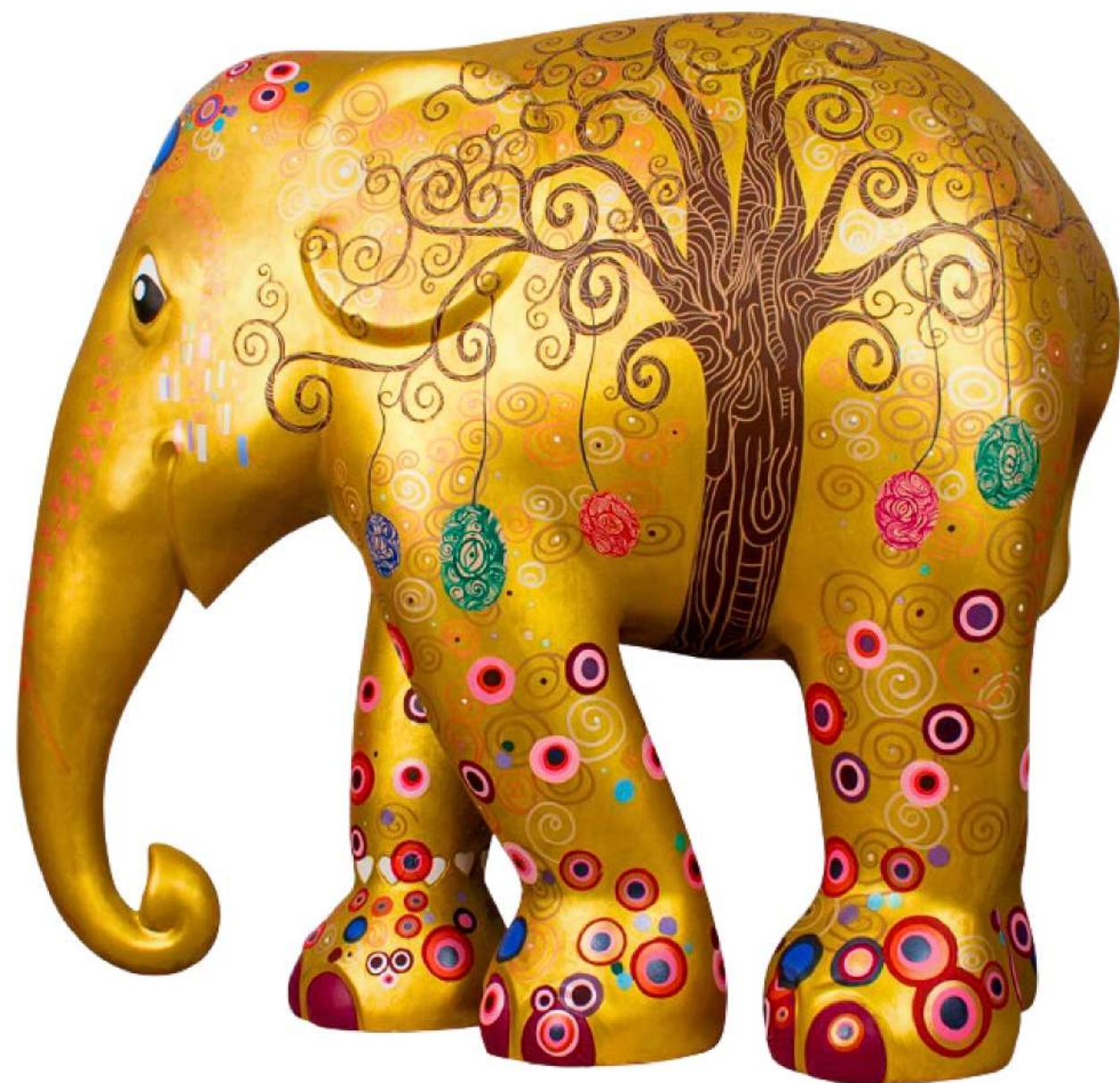
Tree Of Life