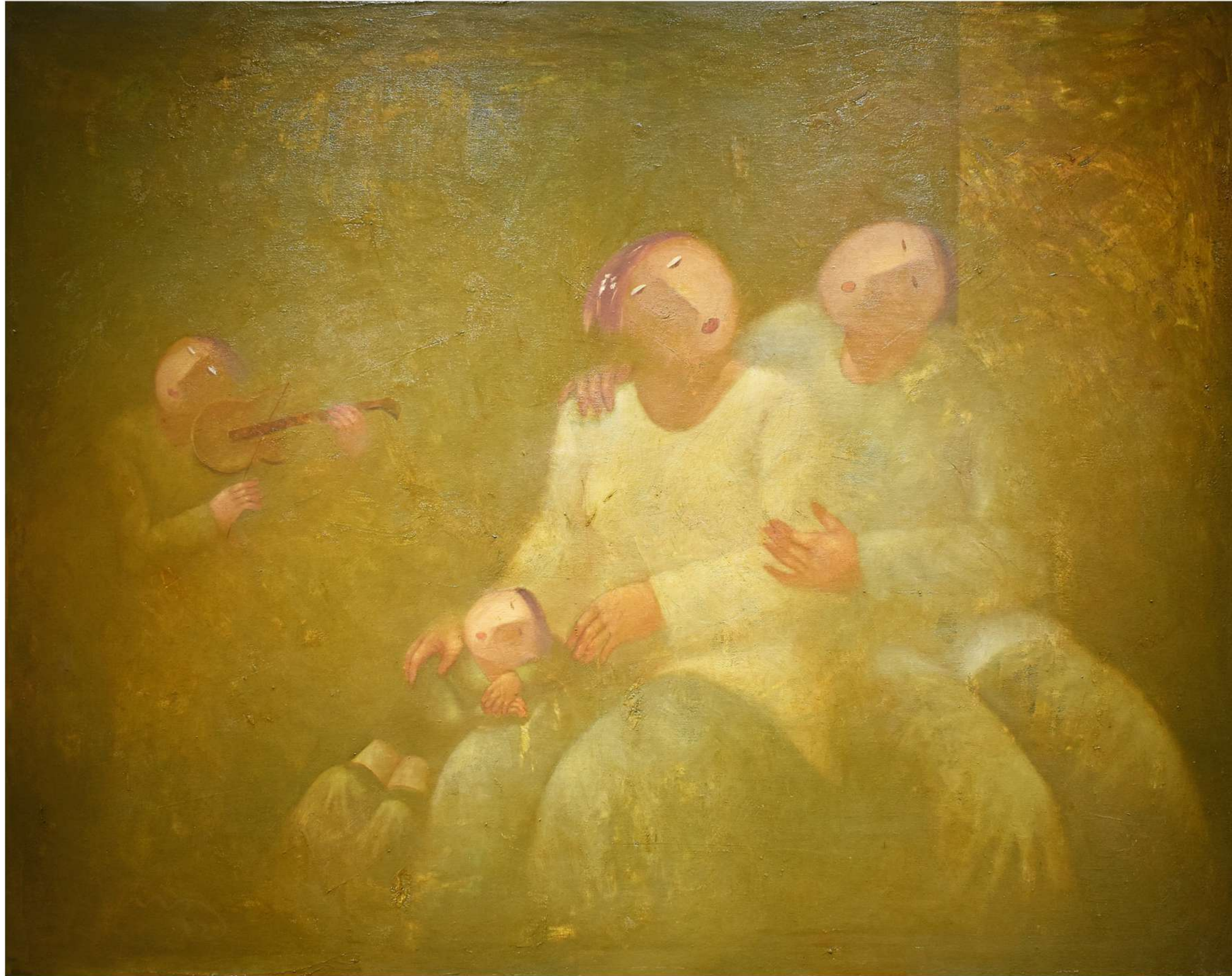
Soothing Moment II 107 x 137cm, oil on canvas, unique edition, 2012