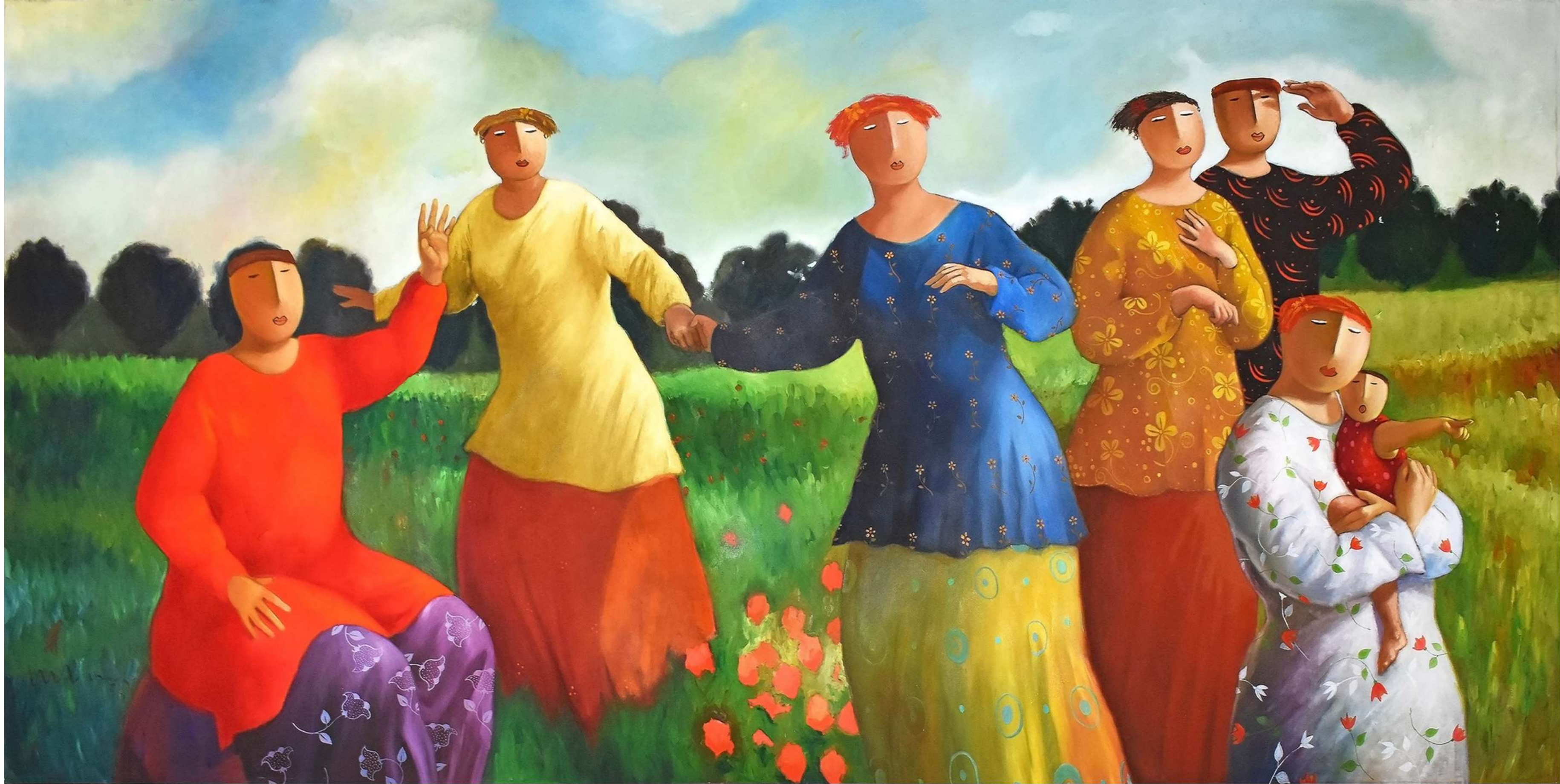
Home Coming II 153 x 305cm, oil on canvas, 2007