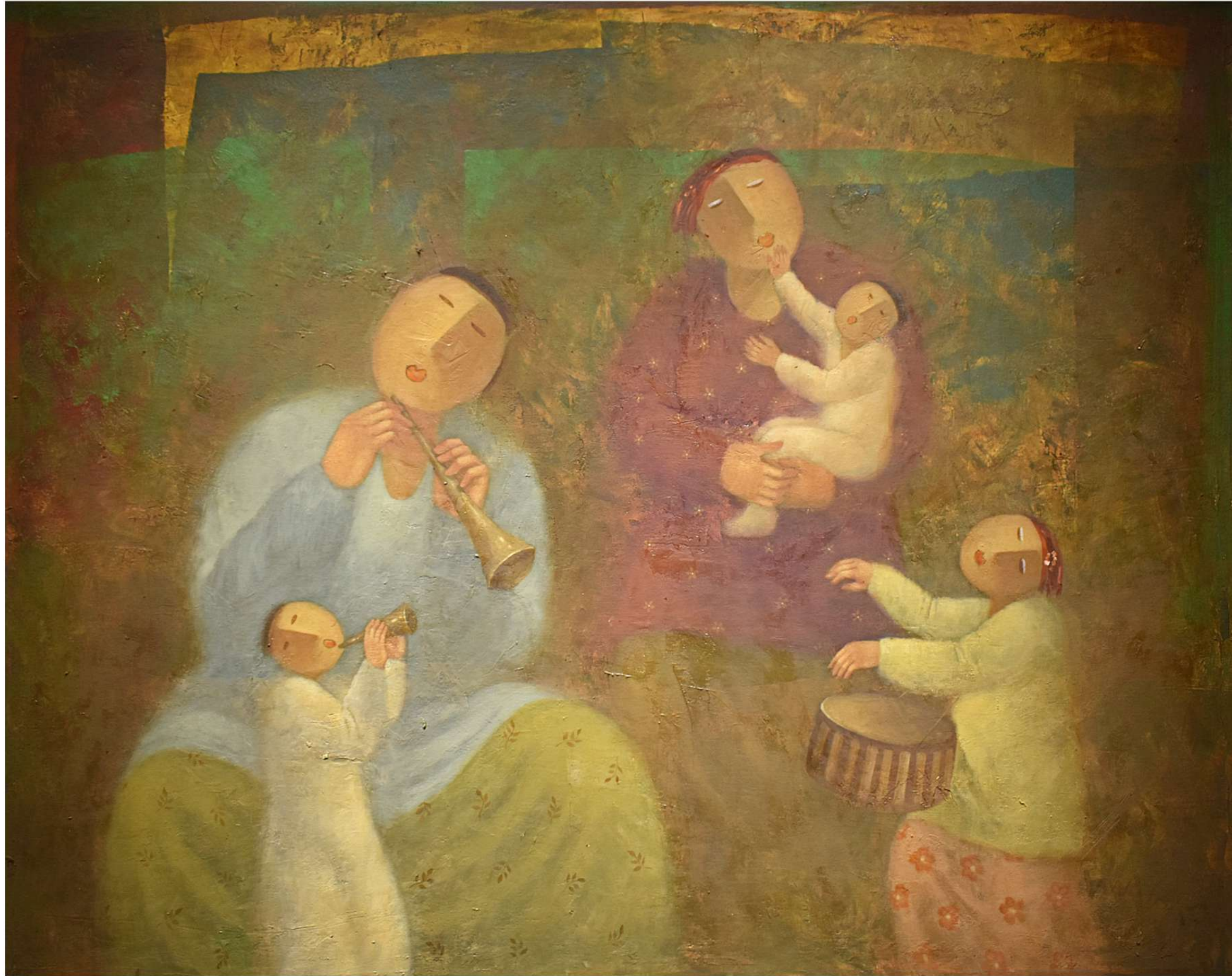
Family Recital 107 x 137cm, oil on canvas, unique edition, 2017