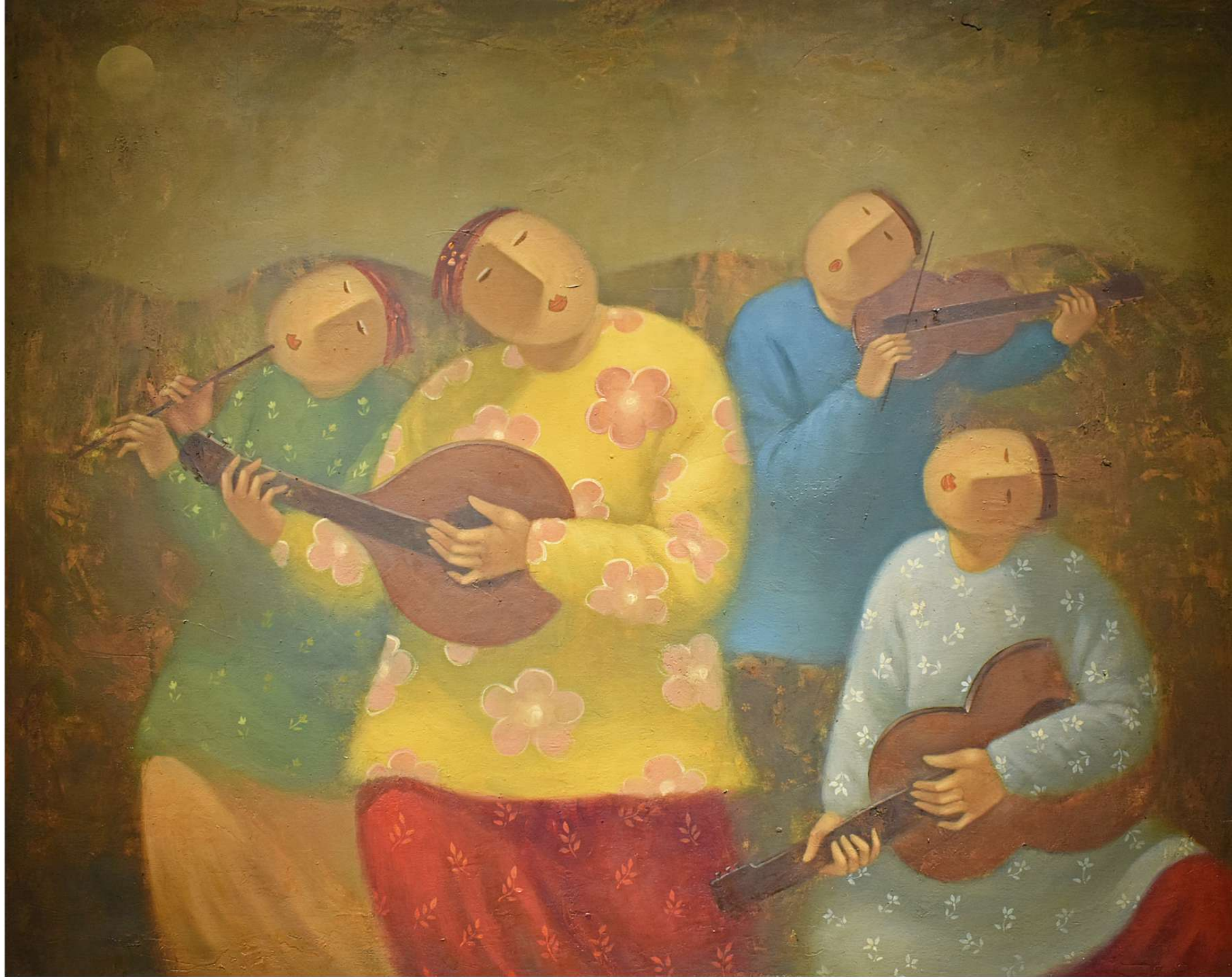
Spring Festival II 107 x 137cm, oil on canvas, unique edition, 2012