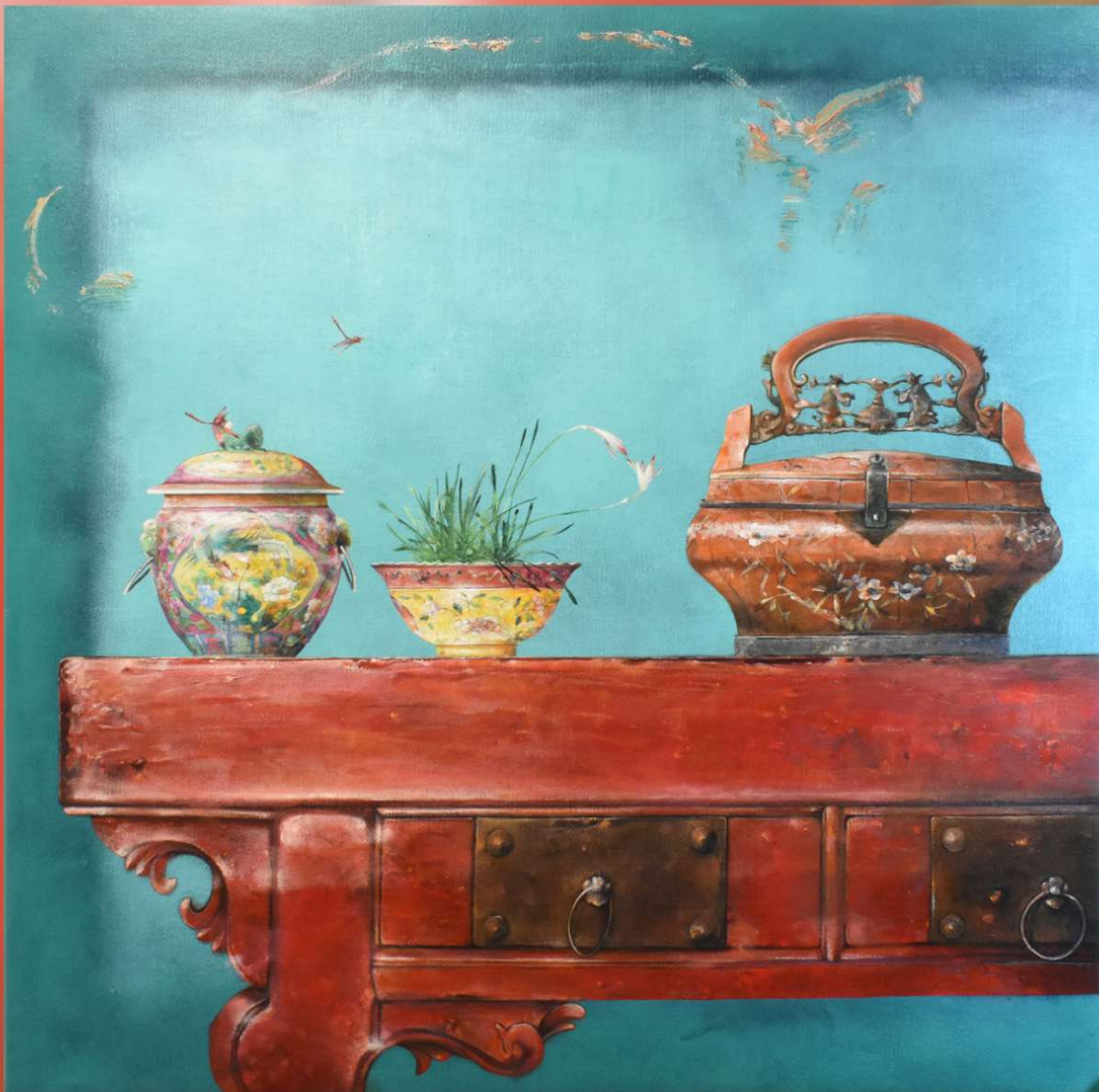
Turquoise Dream , 122 x 122cm, Acrylic on canvas, 2021