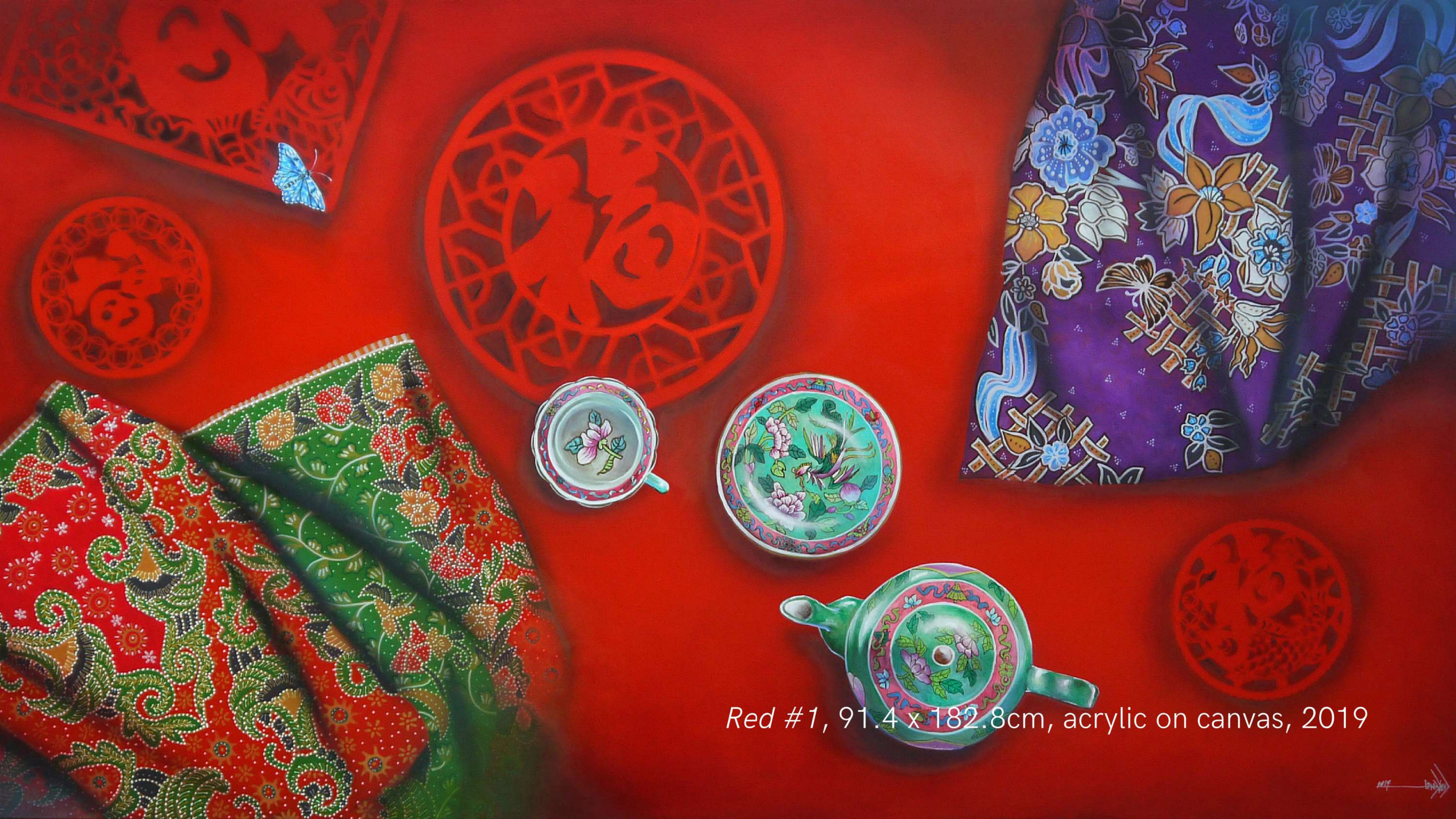
Red #1, 91.4 x 182.8cm, acrylic on canvas, 2019