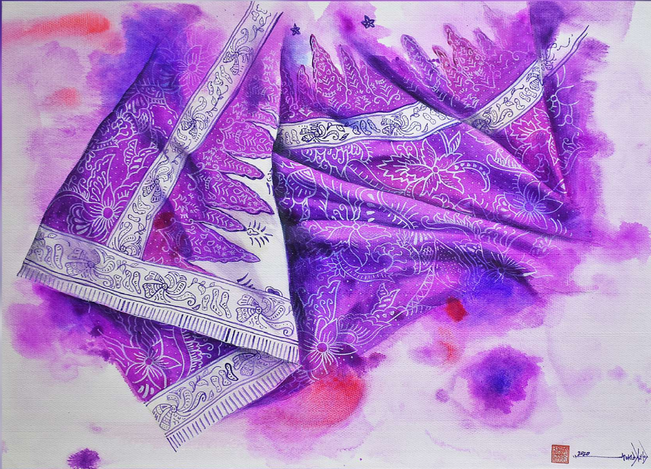
Embracement Of Colour 2, 78 x 59cm, mixed media, 2020