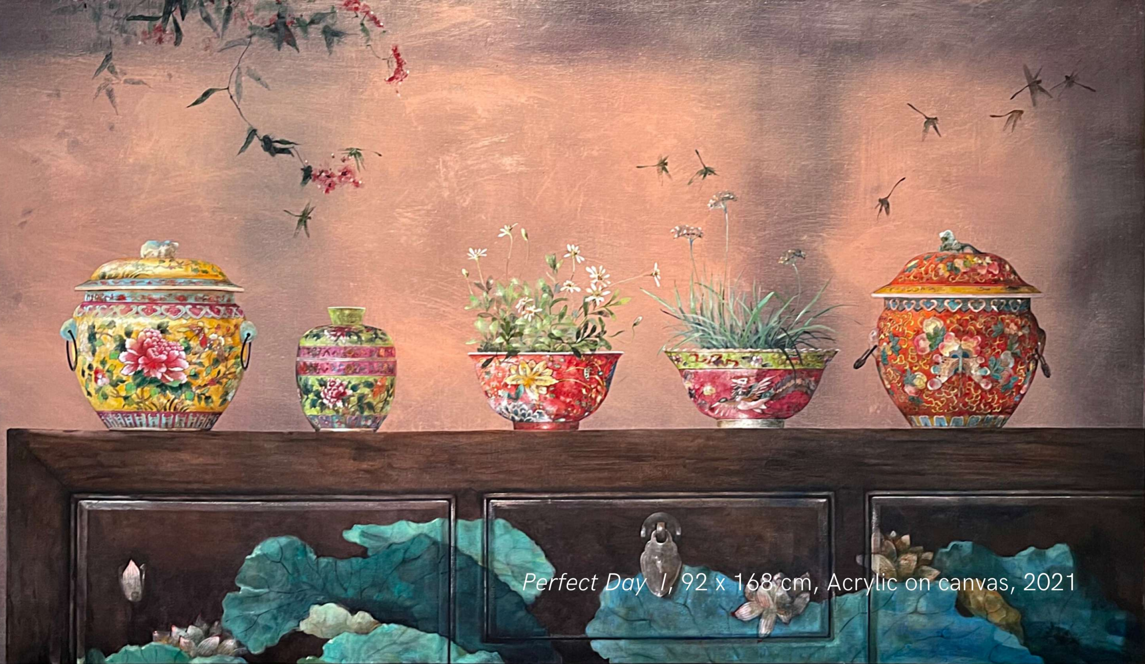
Perfect Day I , 92 x 168 cm, Acrylic on canvas, 2021