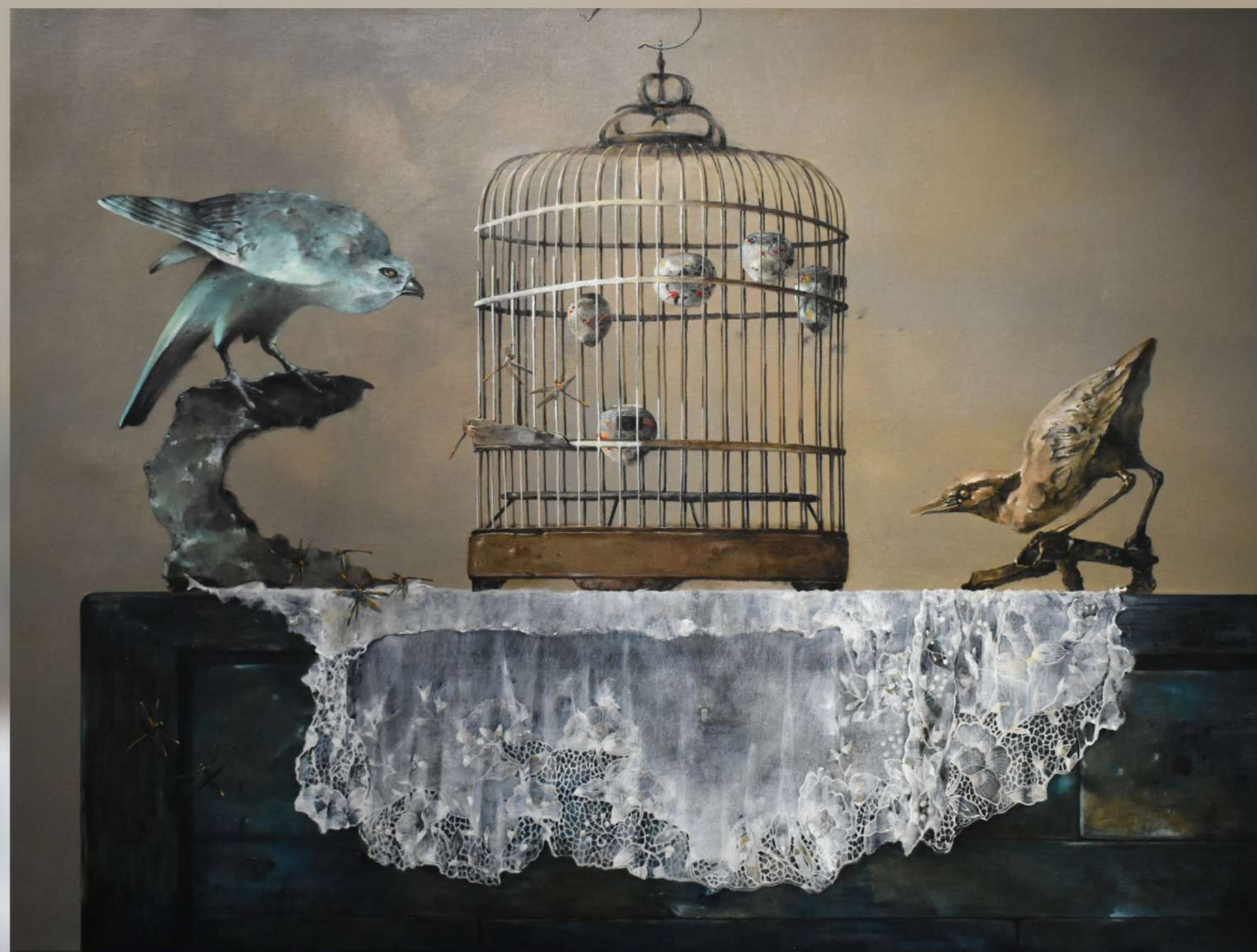
Awaiting II , 91.44 x 121.92cm, Acrylic on canvas, 2021