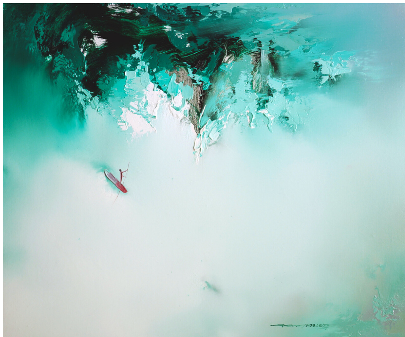
Listening to the tides under the moon No.1