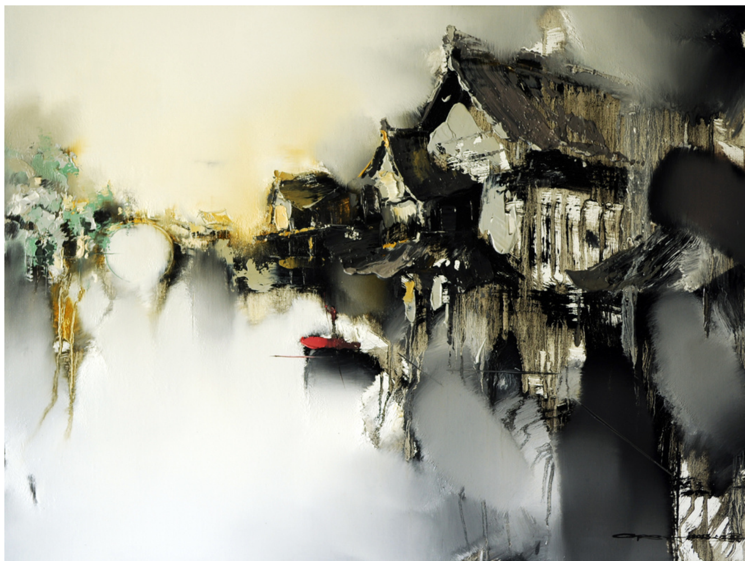
Restful in the late maple No.5