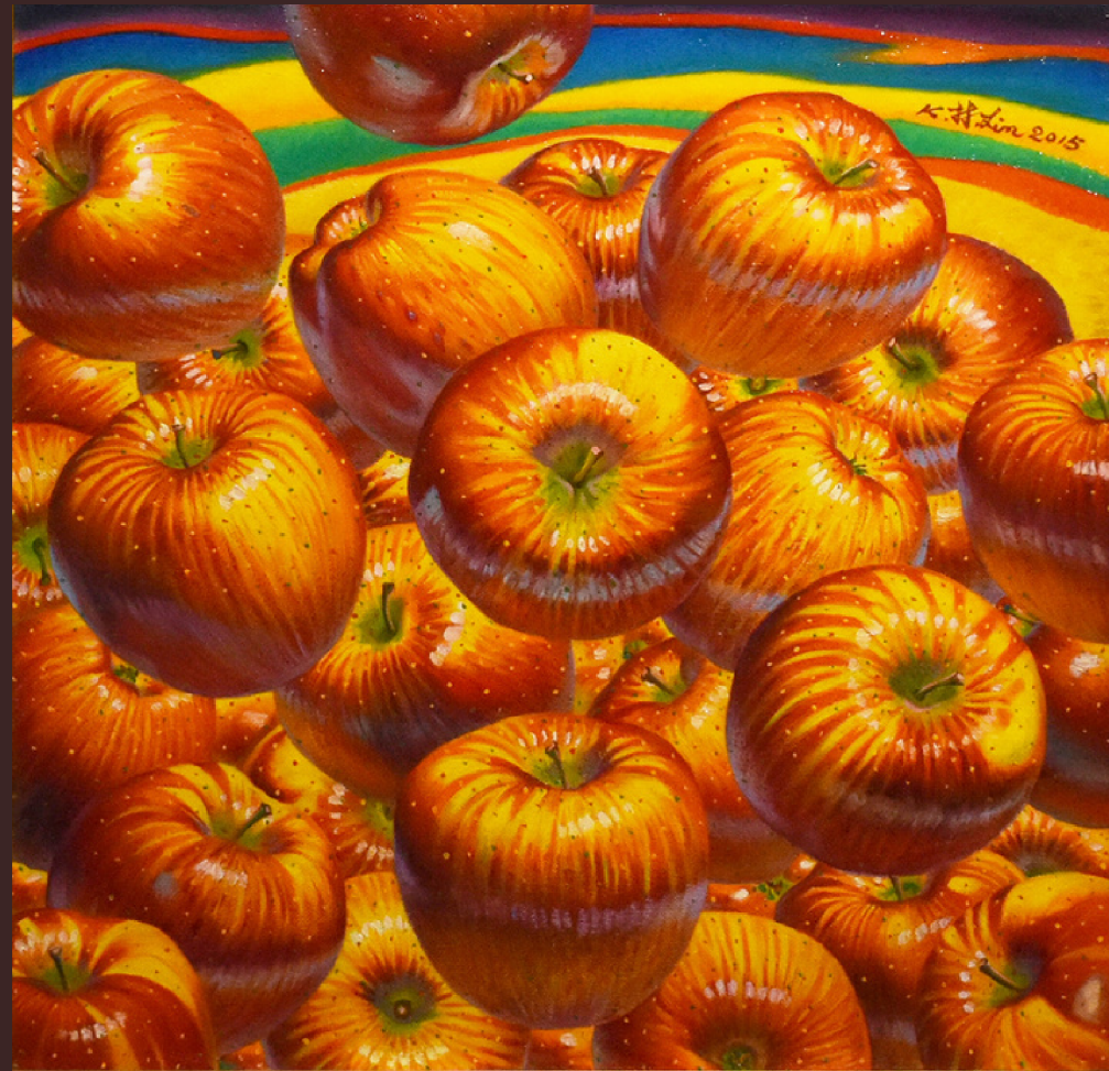
Joyful Living 2015 Oil on canvas | 45 x 45 cm