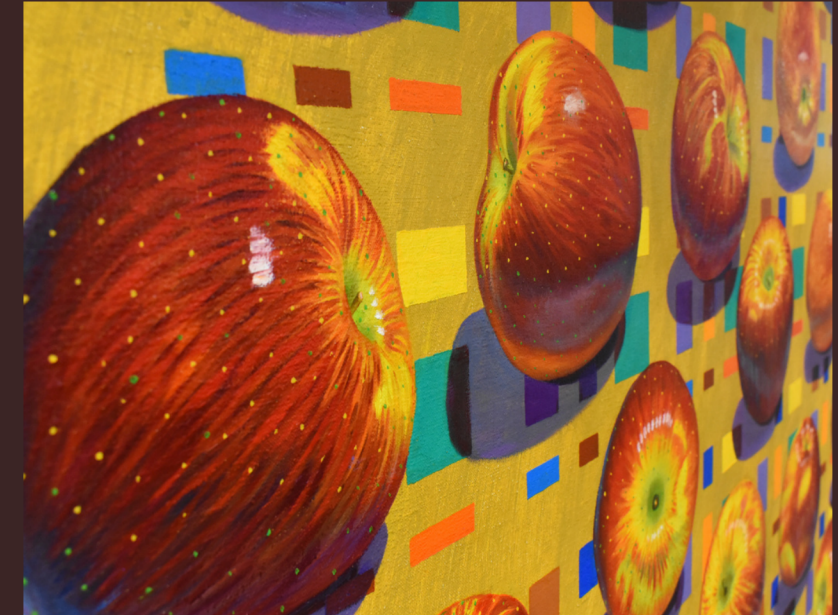
Colourboxes 2021 (details) Oil on canvas | 200 x 300cm