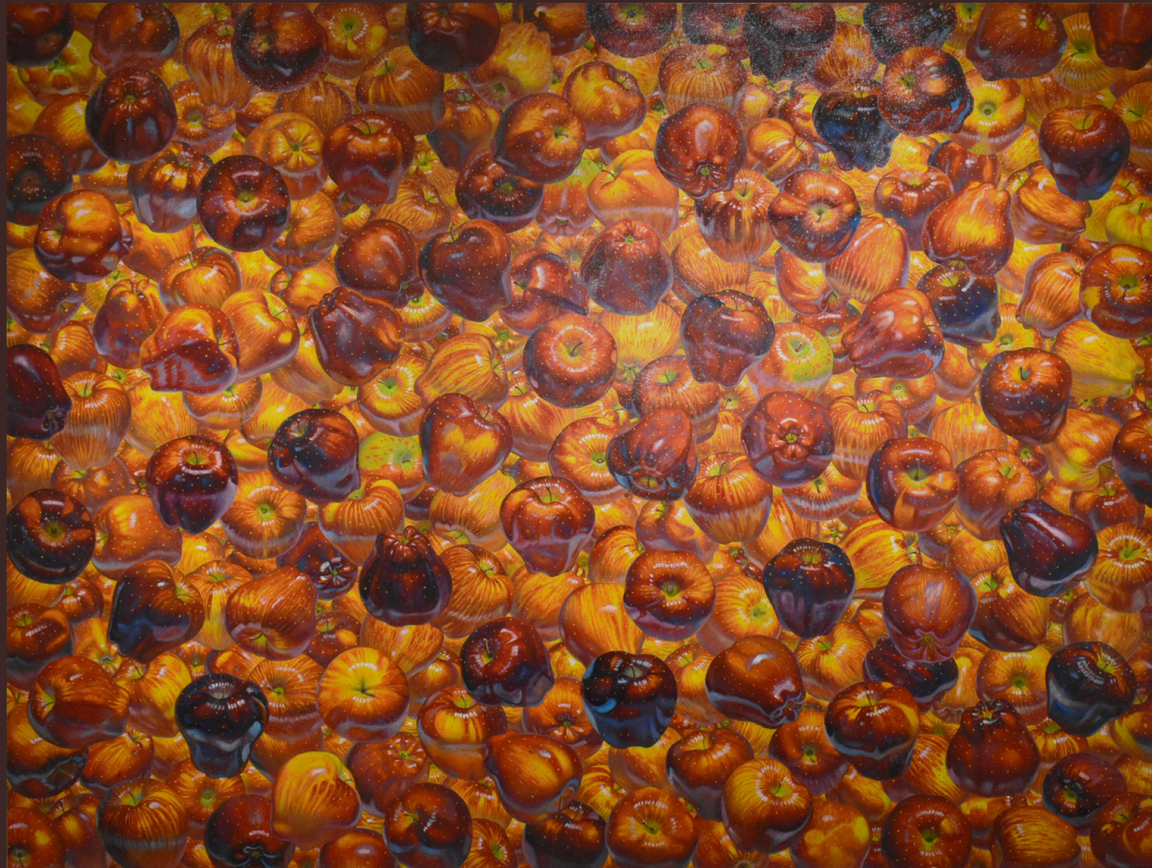
Harmony & Peace 2018 Oil on canvas | 150 x 200cm