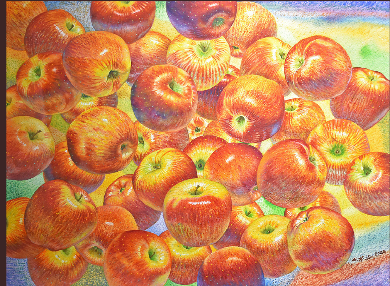
Joyful Living 2022 Watercolor on paper | 58 x 77.5 cm