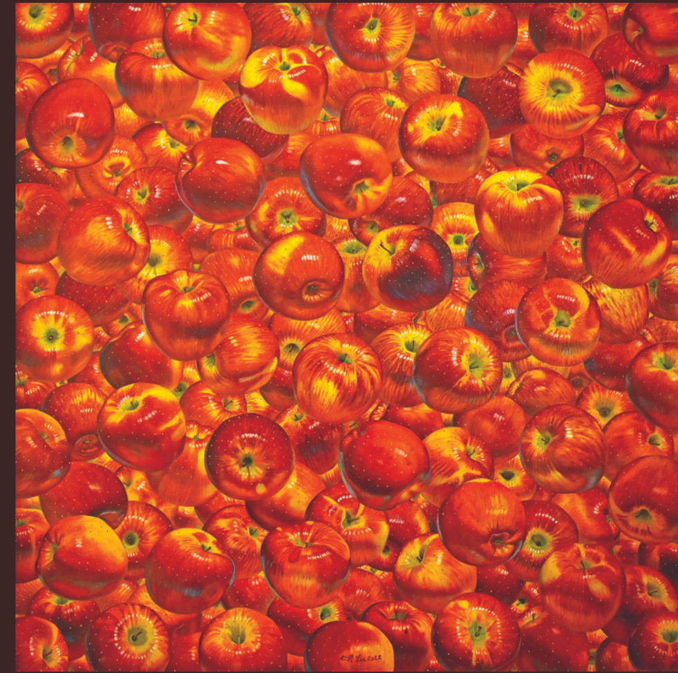
Harmony & Peace 2022 Oil on canvas | 120 x 120 cm