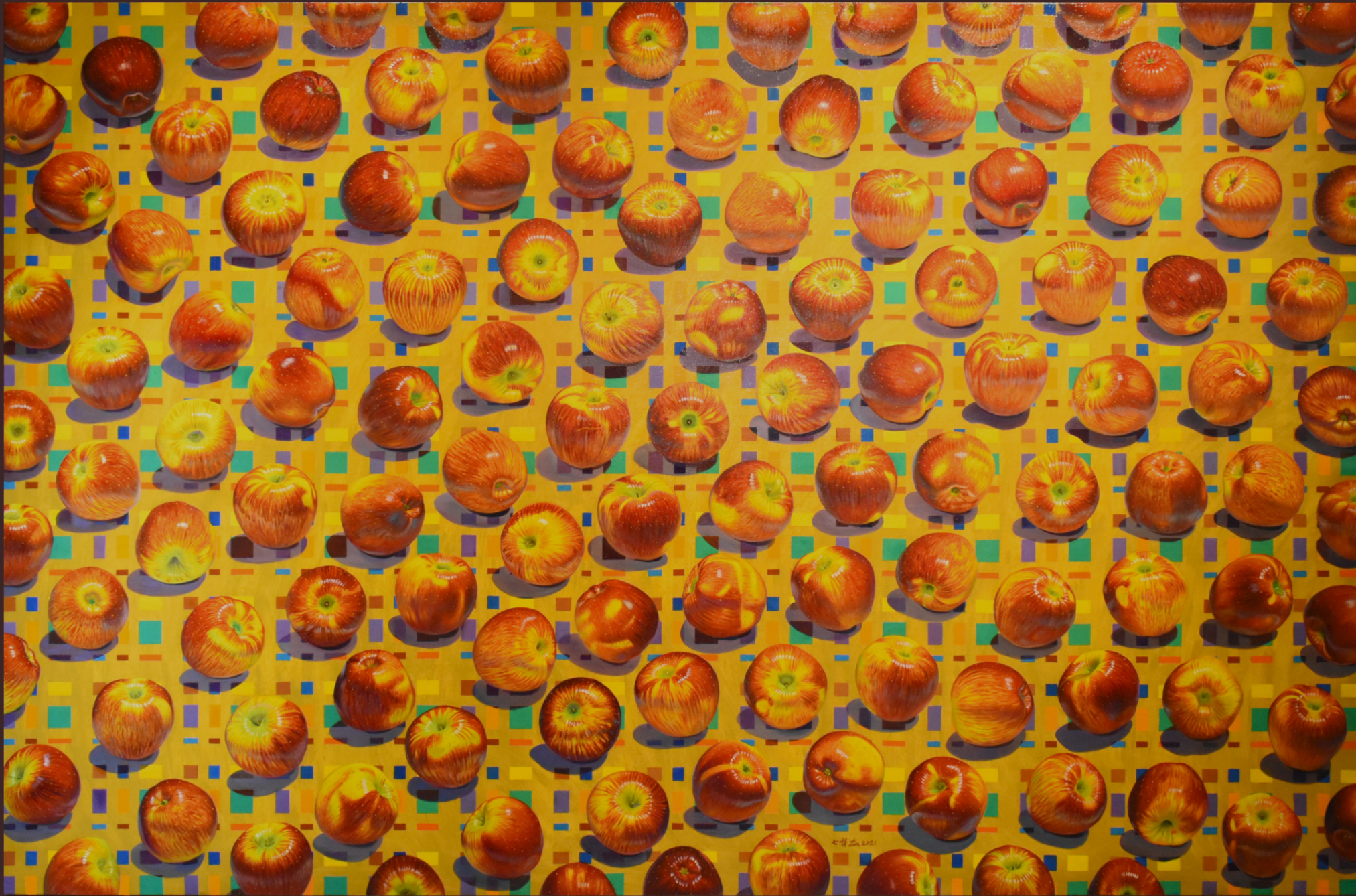
Colourboxes 2021 Oil on canvas | 200 x 300cm