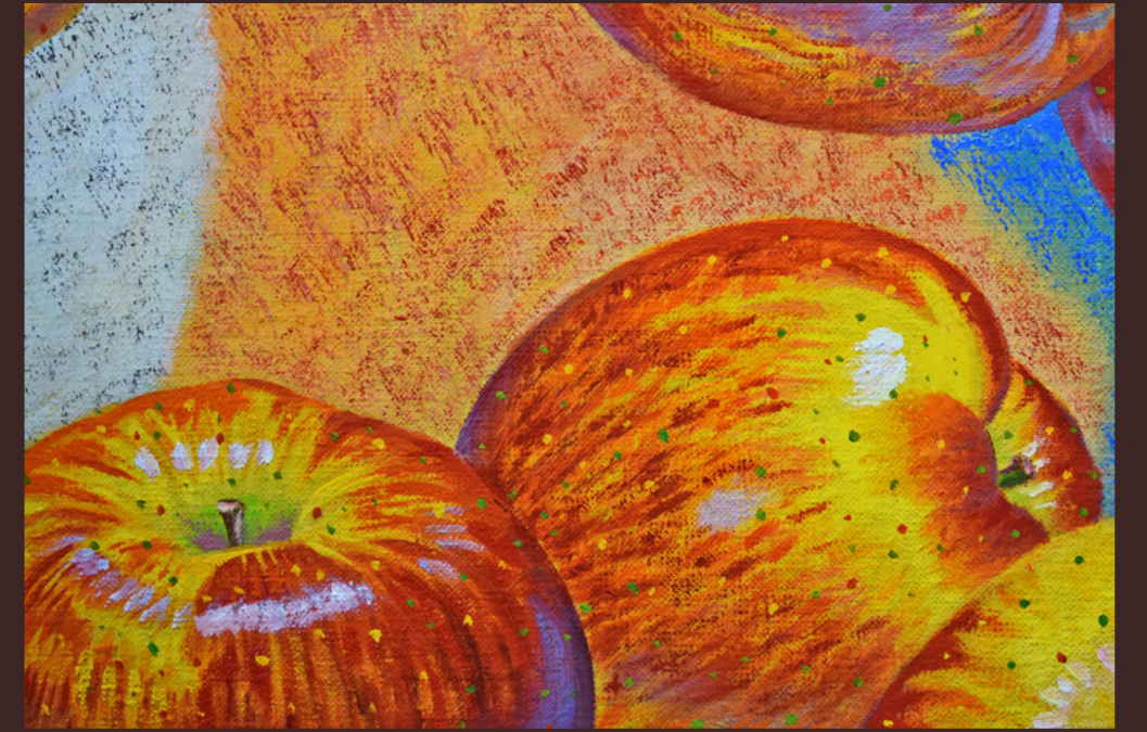
Joyful Living 2013 (details) Oil on canvas | 200 x 300 cm