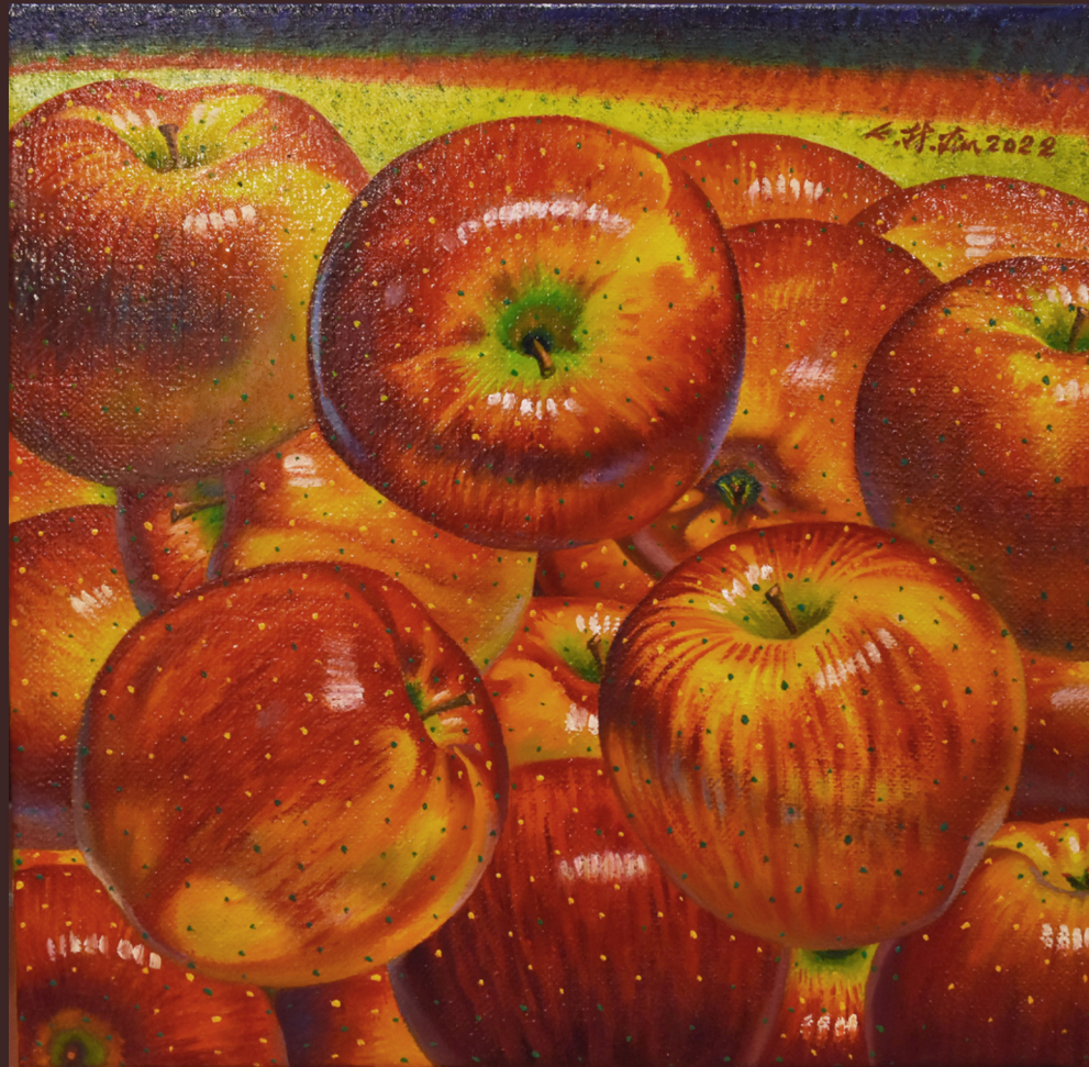
Joyful Living 2022 (SOLD) Oil on canvas | 30.3 x 30.4 cm