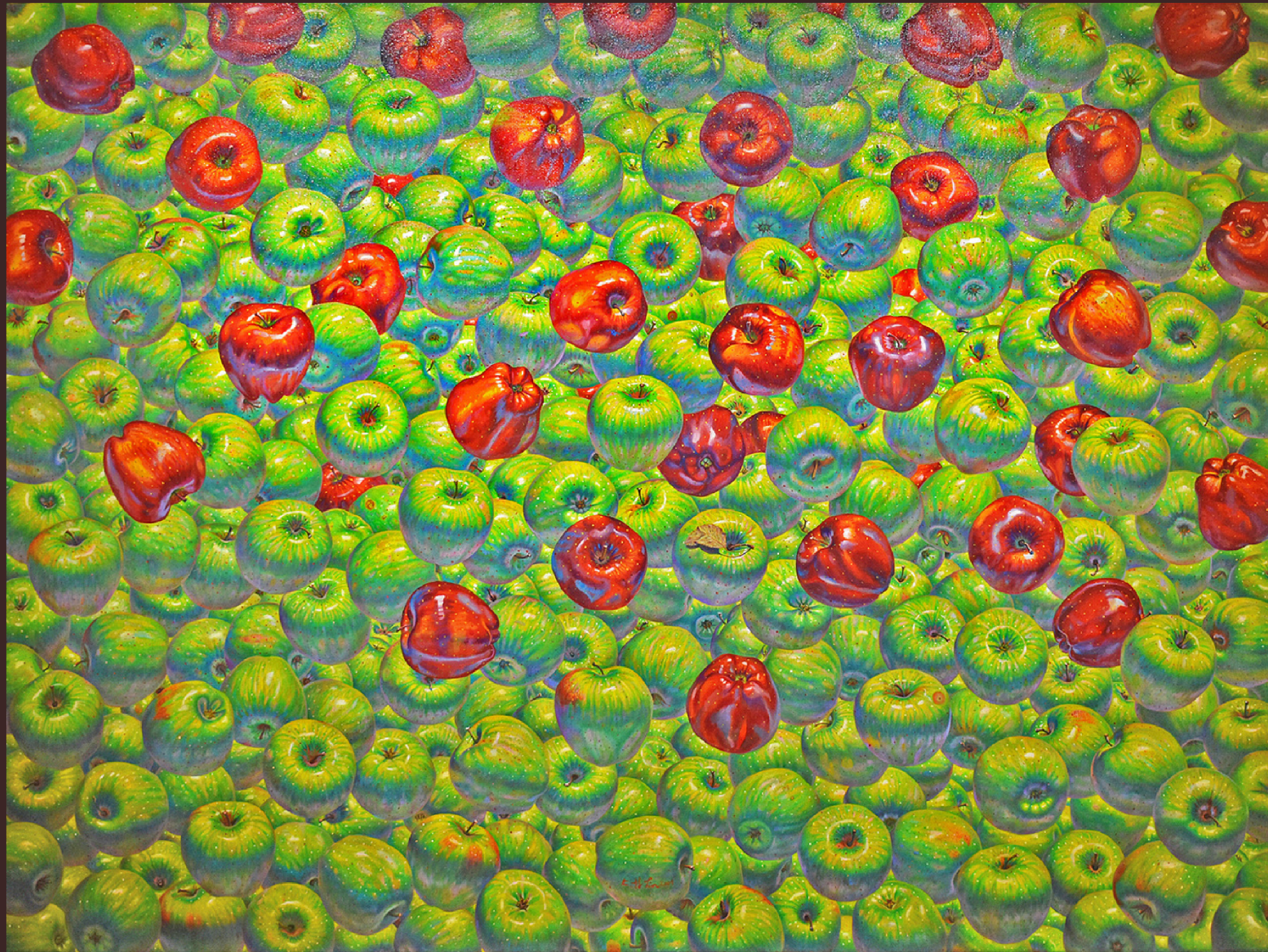
Harmony & Peace 2009 Oil on canvas | 150 x 200 cm