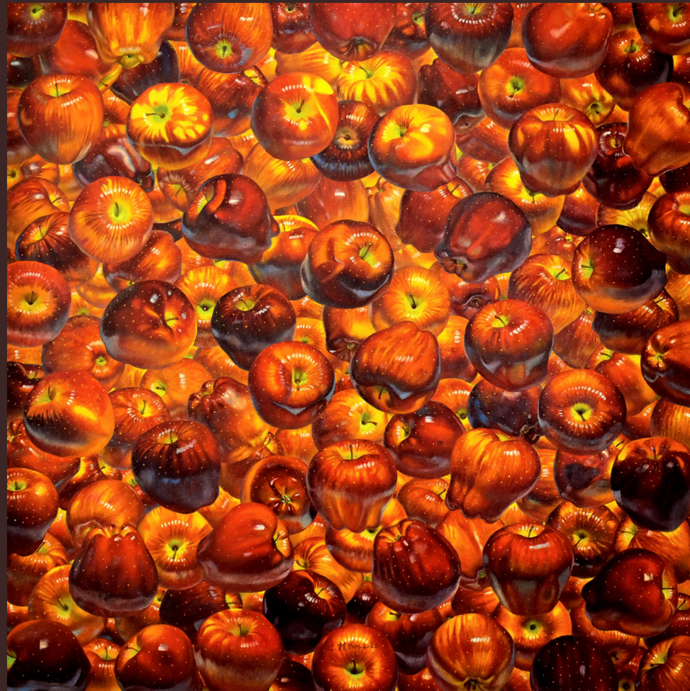
Harmony & Peace 2022 Oil on canvas | 120 x 120 cm