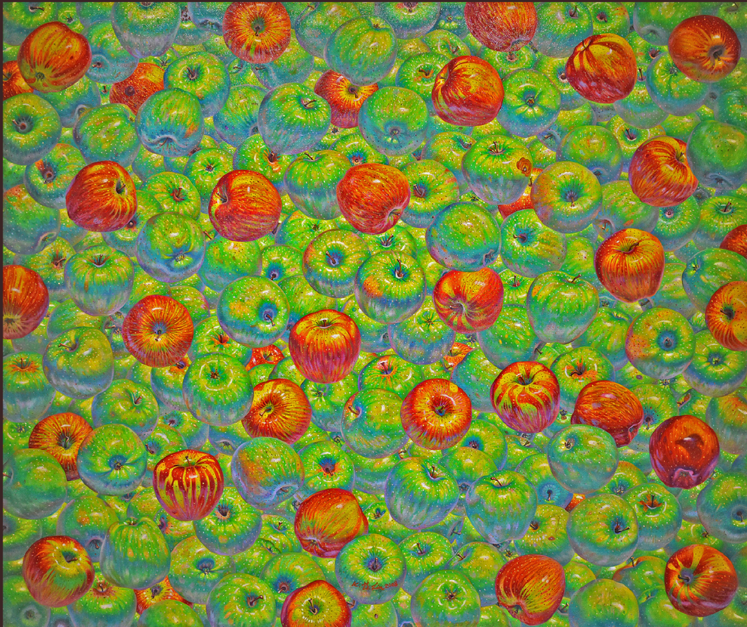
Harmony & Peace 2008 Oil on canvas | 122 x 147 cm