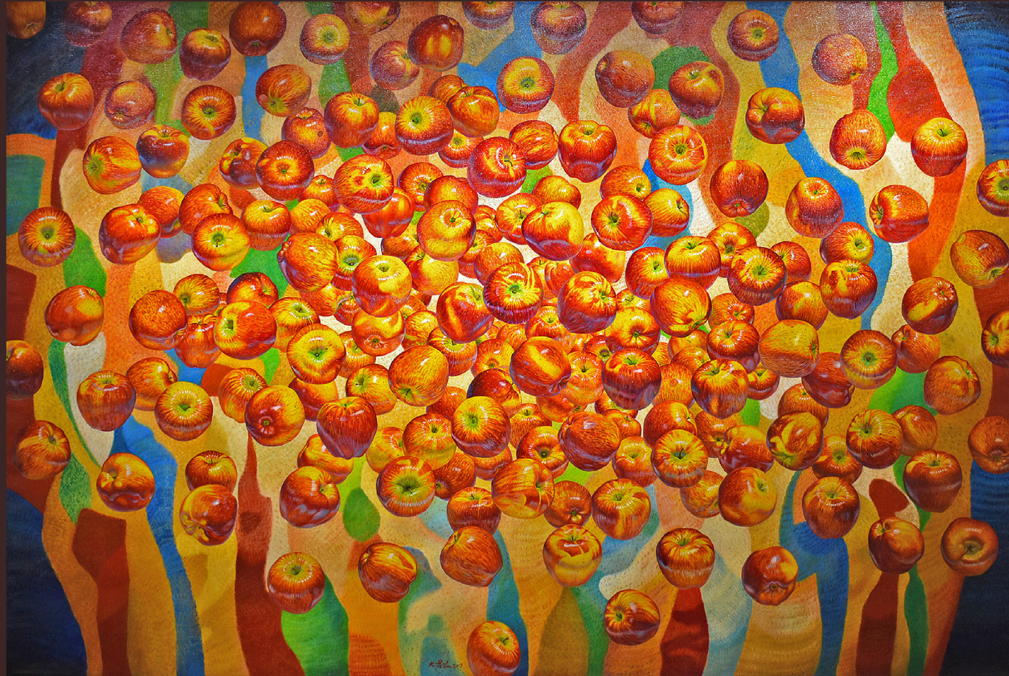
Joyful Living 2013 Oil on canvas | 200 x 300 cm