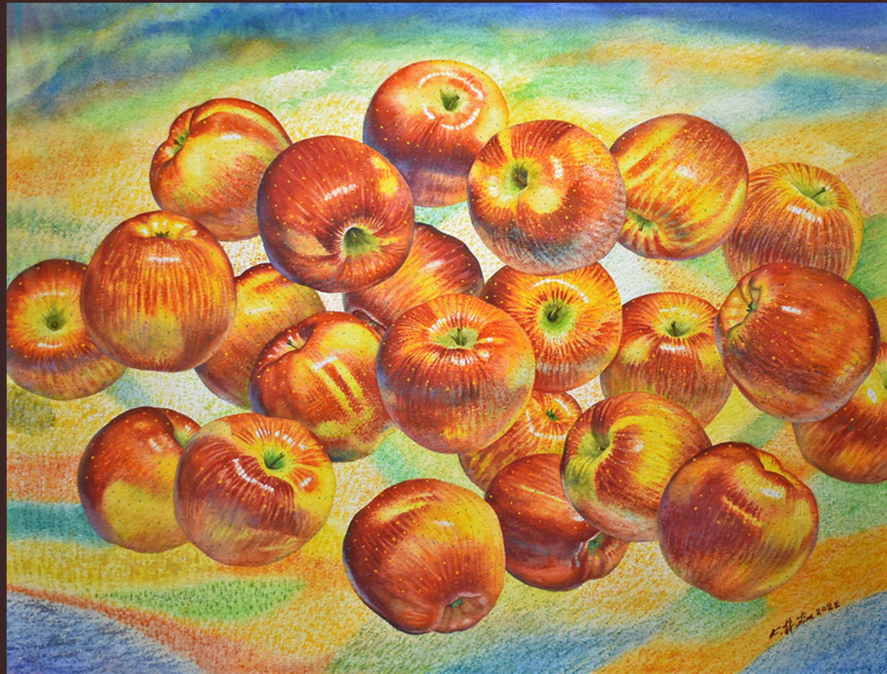
Joyful Living 2022 Watercolor on paper | 58 x 77.5 cm