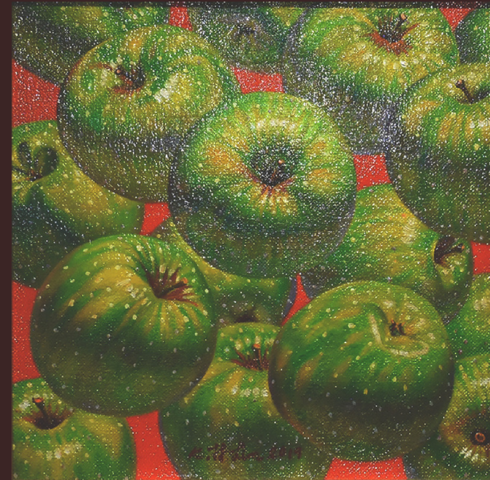
Joyful Living 2019 Oil on canvas | 30 x 30 cm