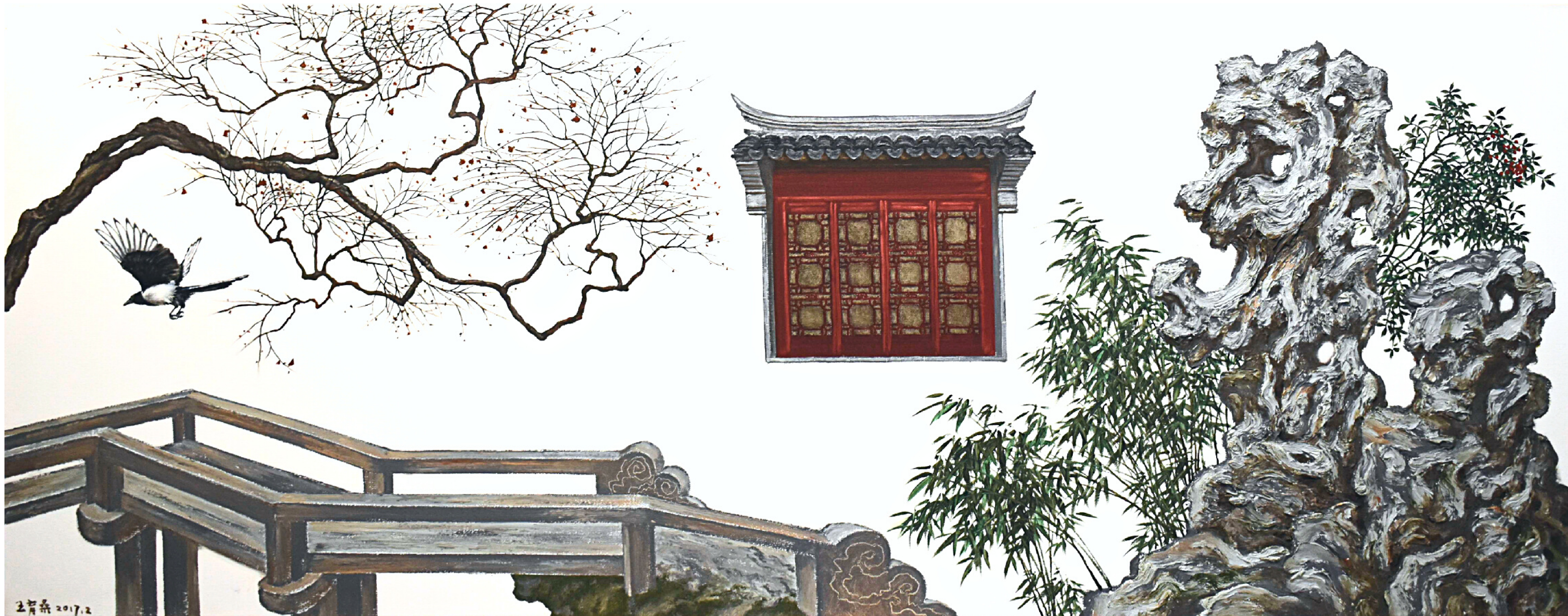
Sing By The Branches 唱枝头, 80 x 200cm, Oil On Canvas, 2017