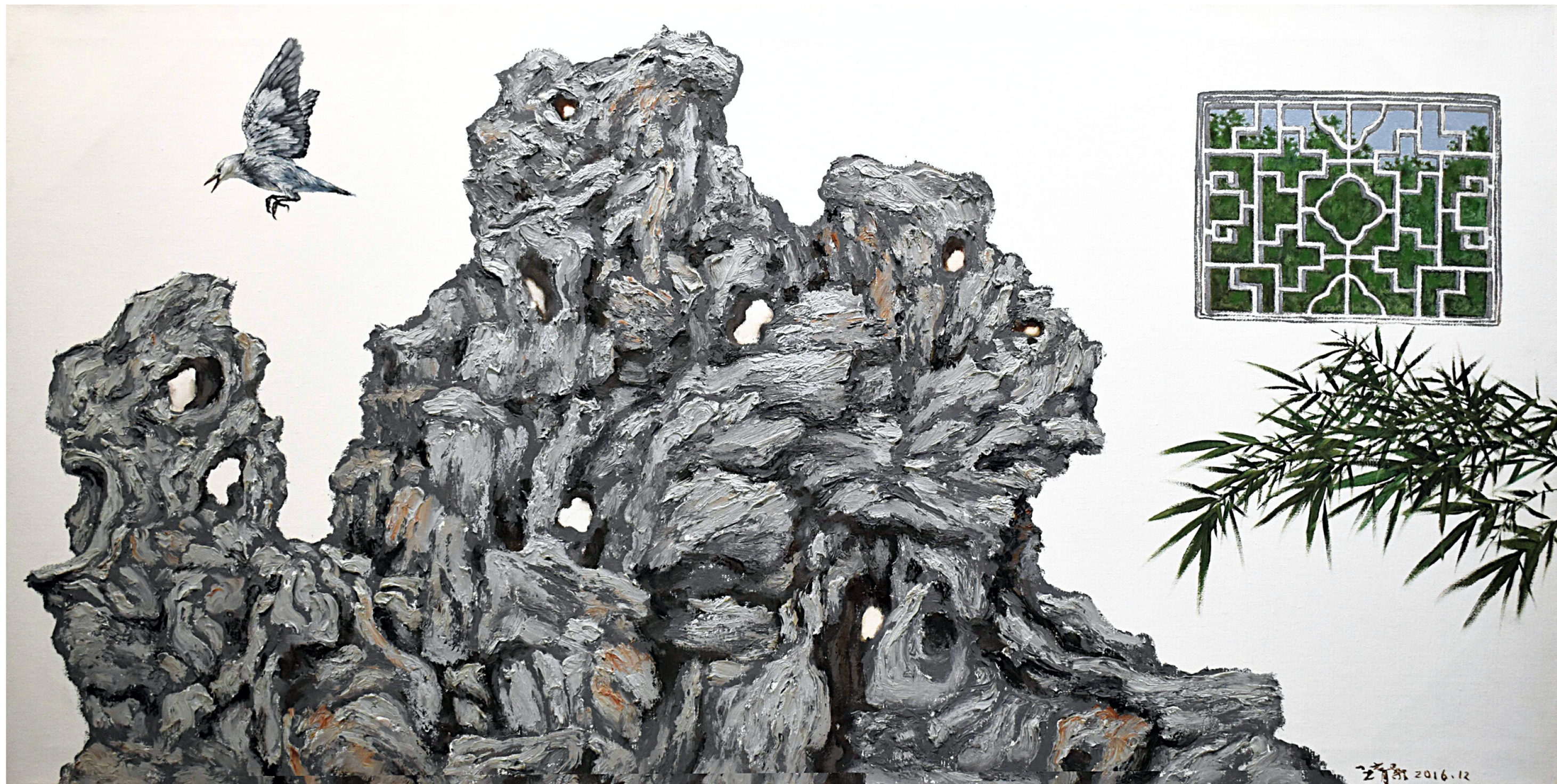
Soar over the Mountain 轻羽千山, 80 x 160 cm, Oil On Canvas, 2016