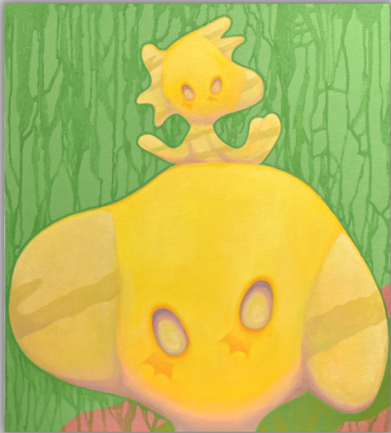
BEZ - Peanuts 2 50 x 40 cm | Oil on canvas | 2021