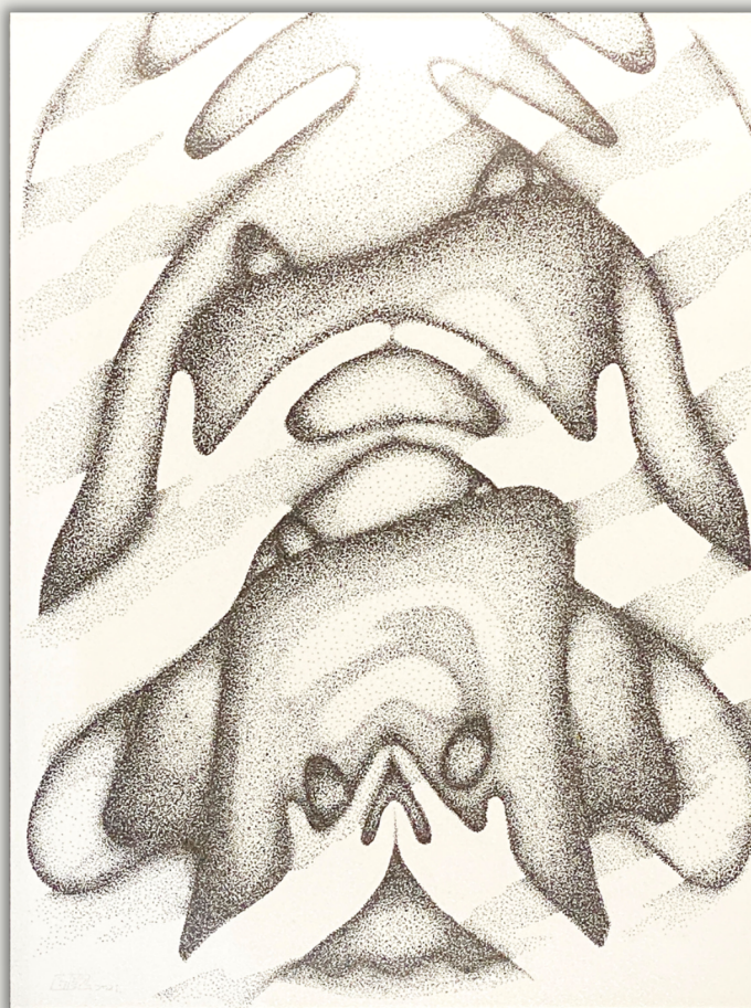
BEZ Game 4 41 x 29 cm | Ink on paper | 2022