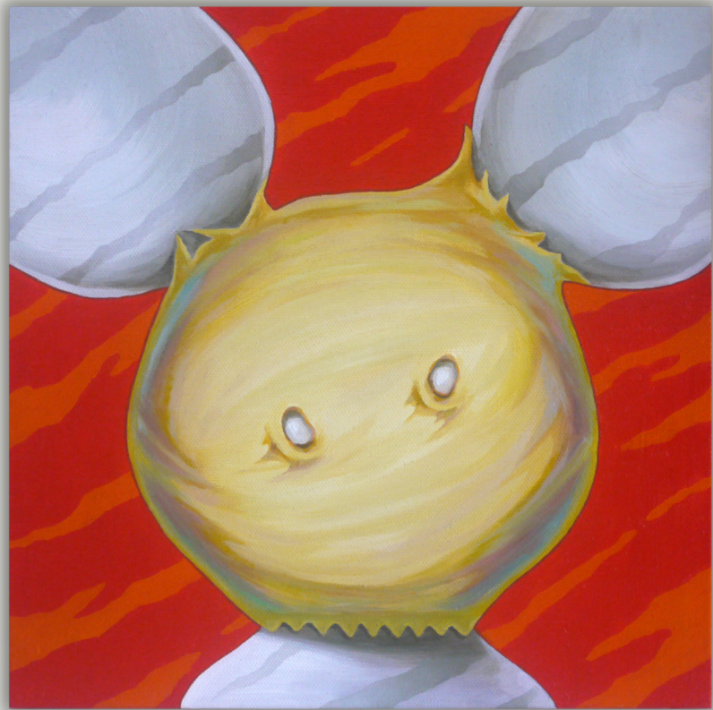
BEZ - Mickey 40 x 40 cm | Oil on canvas | 2021