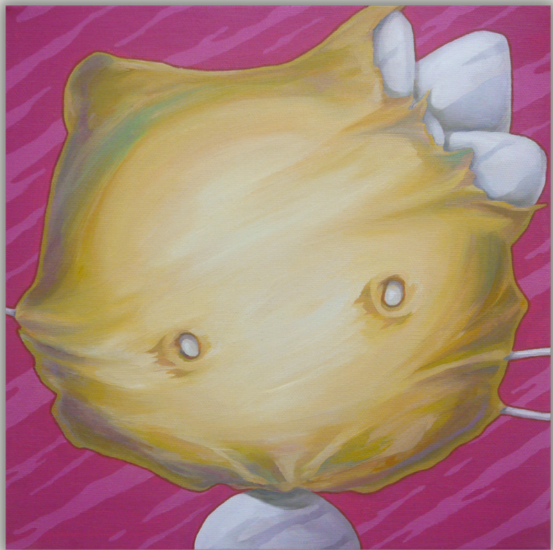
BEZ - Kitty 40 x 40 cm | Oil on canvas | 2021