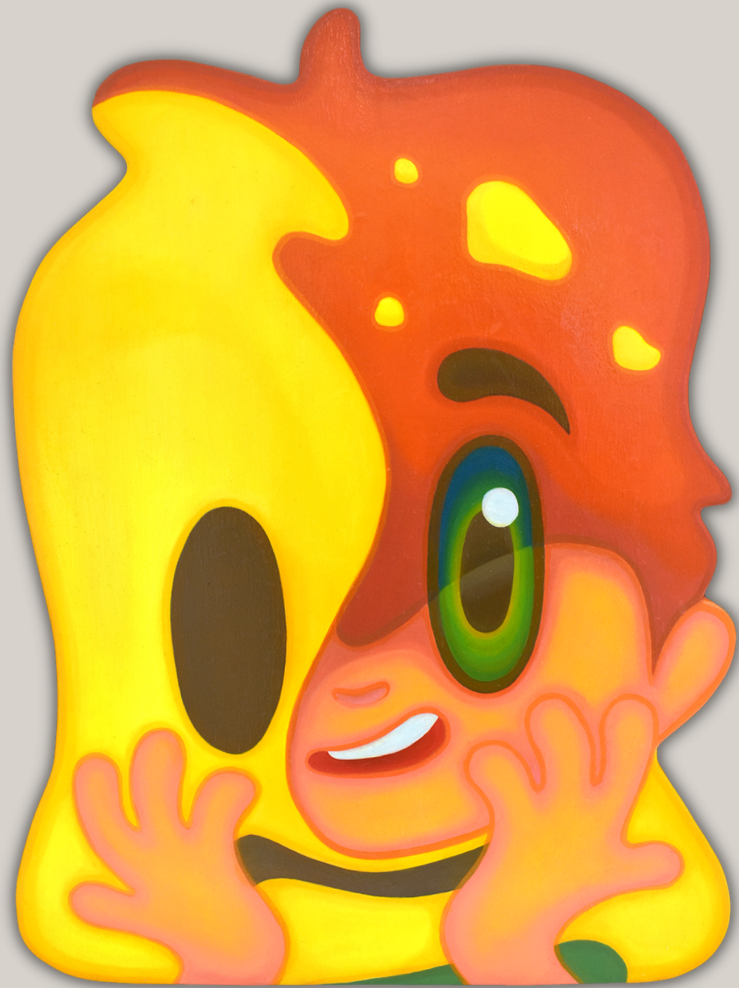
Little Spooky One

52 x 40 x 25cm, mixed media on panel, 2022